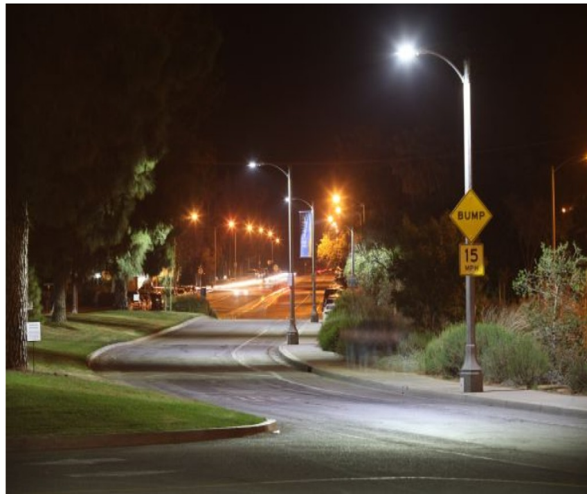
New LED lamps make the walk a little brighter along Big Springs Drive.