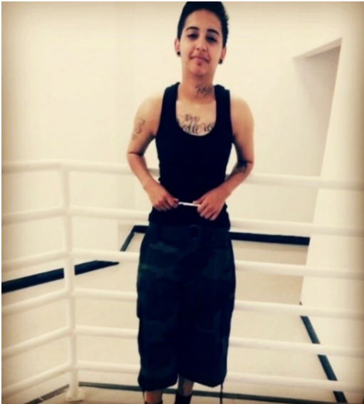
I was out at an event with my group home in 2013

The journey to the country I now call home was filled with danger. The long and exhausting journey involved crossing three borders from El Salvador to Guatemala, from Guatemala to Mexico, and from Mexico to the United States. My sister and I had to trust complete strangers in transporting us across these three borders. We had been walking for some time when my sister told a guy who was taking us that she had a headache. The guy told her that she would give her a pill as soon as we got to our destination, but I told her not to accept anything from anyone – that we couldn't trust them. As the older sister, I knew I had to protect my younger sister. Although I do not recall all the details of this journey, one vivid memory stands out. I recall we stopped at a stranger's house to sleep when I noticed an avocado tree in their house. I picked an avocado to share with my sister to ease our hunger. When my sister and I finally set foot in Mexicali, Mexico, we got separated. My sister was taken through a different route and entered the U.S. in a vehicle, but I had to climb a ladder and run across the Mexico-U.S. border. My sister and I were not reunited in the U.S. until three days later. I could not wait to call my grandmother to let her know we finally made it to the U.S. Sadly, she died during our journey to the U.S.