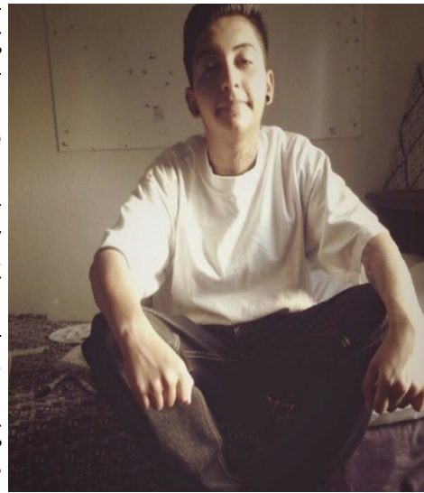
When I was in a group home in 2013.

I spent most of my teenage years being pushed to the margins of society, being told that is where I belonged. Because of my juvenile record and my grades in school, I could not be accepted in regular