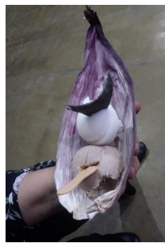
Ice cream served at the closing ceremony of the conference, from Heladería Coyotitla .