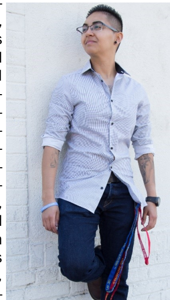
Visiting USC in 2018.

the stigma that labeled me contributing toward my attainment of negative credentials is not easily wiped away given deeply entrenched systems of oppression. But to end on a positive note, having lived these two worlds, I am committed now more than ever, to continue my path toward a Master of Social Work degree at the University of Southern California, and will continue to defy labels.