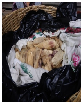
Tamales served at the closing ceremony of the conference!