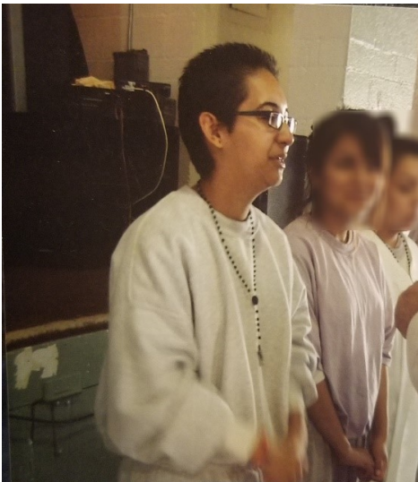
When I was incarcerated in a juvenile Probation camp, Camp Kenyon Scudder