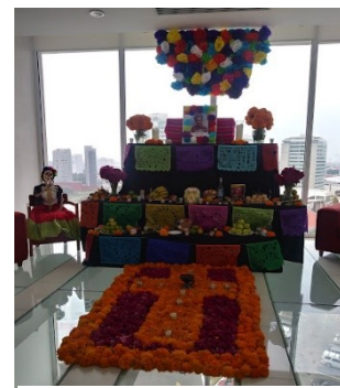
Day of the Dead , a Mexican holiday when people celebrate and honor loved ones that have passed away, altar to honor Frida Kahlo was displayed at the conference hotel.