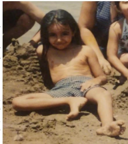
At the beach in El Salvador. I was around 5 or 6 years old.

Three years later, my parents gathered the necessary money to pay for me to join them in El Norte. My grandmother was very ill with cancer. She had been hospitalized for days. One day, late in the afternoon, her husband told my younger sister and me to get ready – that we were heading north. At the ages of 10 and 8, we left without the opportunity to say goodbye to my grandmother. Sadly, she passed away during my journey to the U.S.