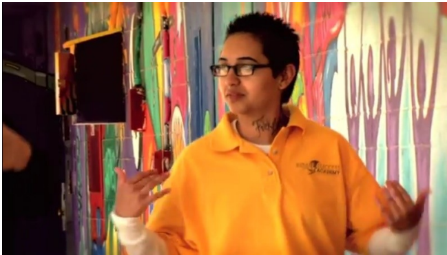
When I was incarcerated in a juvenile Probation camp, Camp Kenyon Scudder in 2013. I was doing an interview with Univision.

Even though many trials and tribulations have been present, education has become a saving grace and a tool of transformation. With no one to lead by example in education, I had to fight to create my own path. While still incarcerated, I enrolled in college and was taking a culinary art class. My release date was approaching, so I told the chef that I was being released soon. He told me that once I was released, I needed to complete his culinary art class at the community college where he taught or he was going to fail me. Days later, I made a comment that I was being released soon, a probation officer told me that I was going to be back soon. When I clarified that I was already 18 and I was not coming back, he noted, “there’s always county jail and prison.”