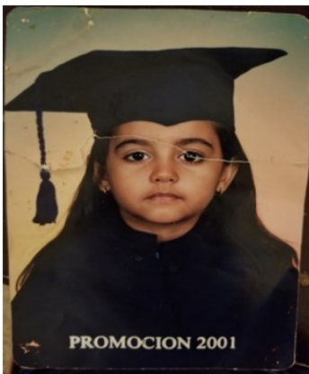
I was around 5 or 6 years old in school.